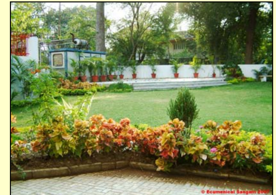
Picturesque garden and landscaped lawn