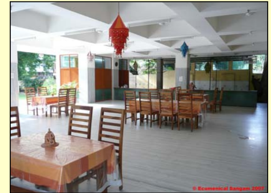
Multipurpose banquet hall