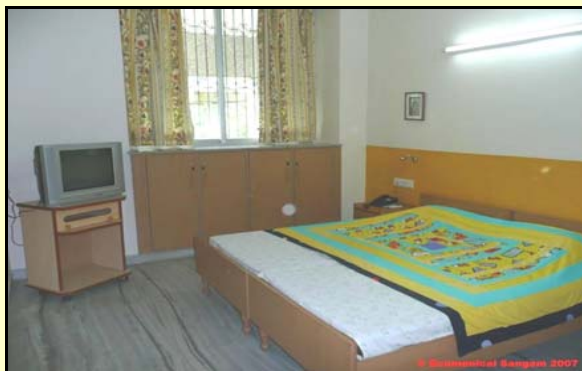
Your home in Nagpur's heart