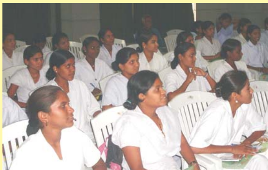
Nursing students participating in CME.

Project coordinator LEAP, participated as a faculty member in primary health staff training programme conducted in five PHC centers under Gadchandur block of Chandrapur District.